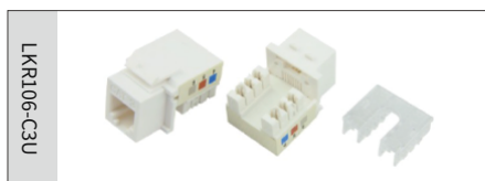
Voice Keystone Jack (RJ Port)